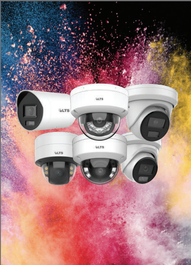
LTS Color 24/7 Cameras with Hybrid Illumination: