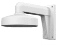
LTB342-140 Wall Mount