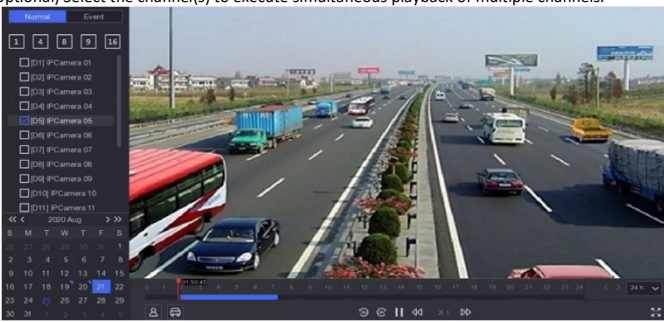
Figure 3-5 Playback