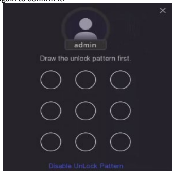
Figure 3-2 Set Unlock Pattern

Step 2 Draw the same pattern again to confirm it.