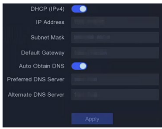
Figure 3-4 Network Settings