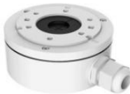
LTB345 Junction Box