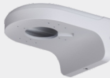
PFB204W Wall Mount