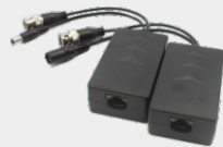
PFM801-4MP Passive HD-over-Coax Balun with Power