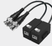
PFM800-E Passive HD-over-Coax Balun