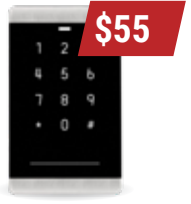
LTK1103MK Keypad w/ 12 keys IP64