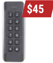
LTK1802MK Keypad w/ 12 keys IP65