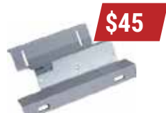
LTKLBLZ06 LZ Bracket for LTKL206