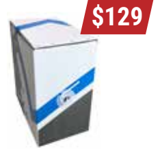
LTAC1806G-CMR 18 AWG 6 Conductor CMR Rated Gray Stranded Shielded 500ft