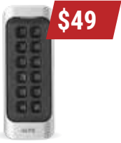
LTK1107MK Keypad w/ 12 keys IP65