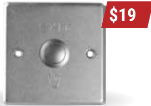
LTKB01 Metal Button (3.39"x3.39"x0.79")