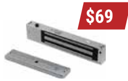
LTKL206 12V 600LB Magnetic Lock