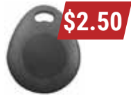
LTKF1356M Key Fob Frequency: 13.56MHz.