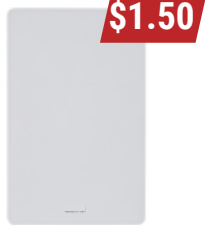
LTKC1356M Smart Card Frequency: 13.56MHz.