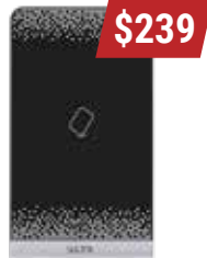
LTKE100ME Plug and Play USB Mifare Card Issuer