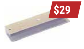
LTKLBU06 U Bracket for LTKL206