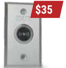
LTKB04 Touchless Button (3.39"x1.97"x1.34")