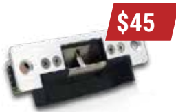
LTKL101 12V Electric Door Strike