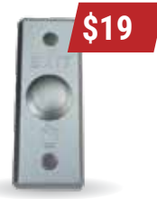
LTKB02 Metal Button (3.54"x1.38"x1.14")